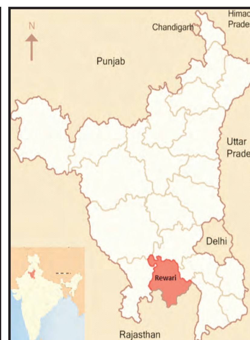
SPRING Site Map